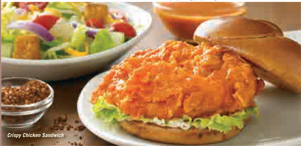
Crispy Chicken Sandwich

A bowl of today's fresh made soup and your choice of a crisp House or Caesar Salad. With French Onion Soup. 7.99