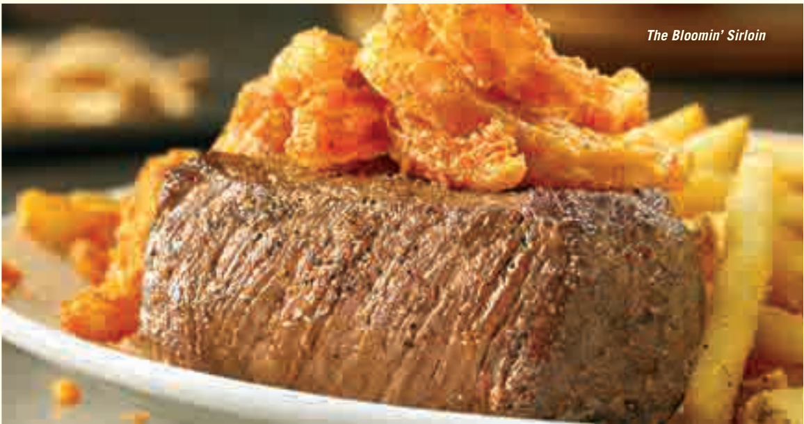
The Bloomin' Sirloin