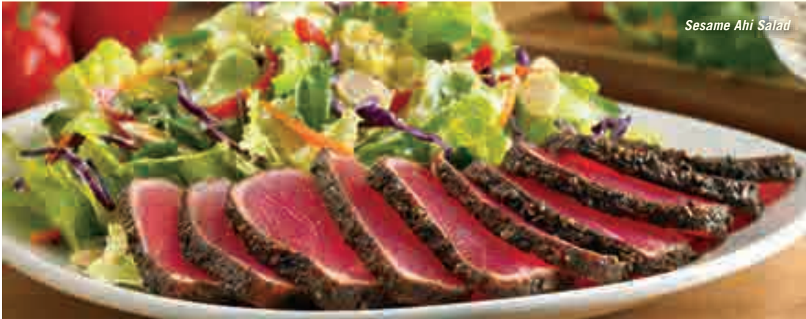
Sesame Ahi Salad

* These items are cooked to order. Consuming raw or undercooked meats, poultry, seafood, shellfish, or eggs which may contain harmful bacteria may increase your risk of foodborne illness or death, especially if you have certain medical conditions.