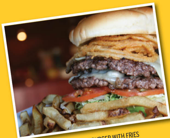
DOUBLE MUSHROOM-N-SWISS BURGER WITH FRIES

Blackened then topped with Pepper Jack Cheese, mixed greens, mild housemade salsa and sour cream ★ 7.99