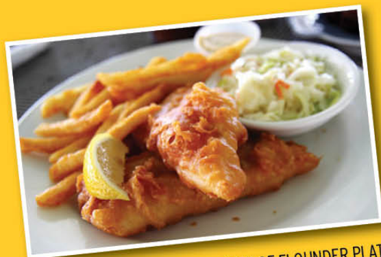
FILET OF FLOUNDER PLATE

Grilled chicken, Pepper Jack cheese, mixed greens, grilled onions, green peppers and salsa ★ 6.69