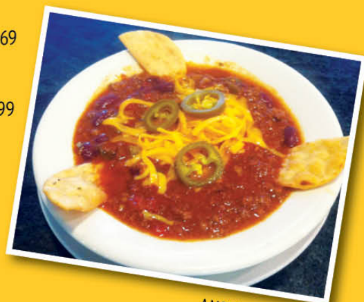
ANGUS BEEF CHILI