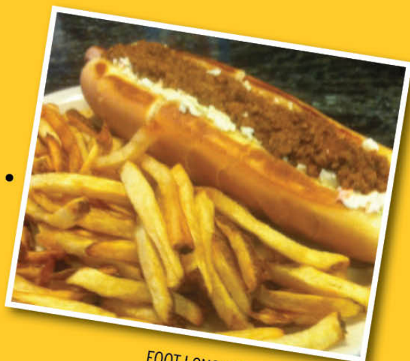
FOOT LONG HOTDOG WITH FRIES

*Consuming Raw Or Undercooked Proteins May Increase Your Risk Of Foodborne Illness